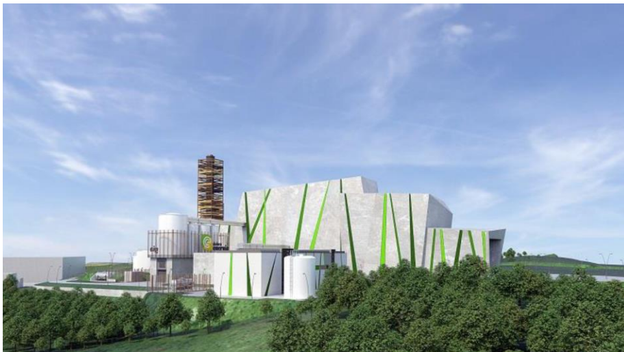
Olstyn Waste to energy plant

This project directly contributes to European policy aiming at reducing the share of landfills as waste management tools and increasing the recovery of energy from waste. It will be a critical contribution of Poland to these EU objectives. Meridiam is proud to add this project to its “circular economy” platform following innovative methanization and biogas projects across France, Spain and Germany.